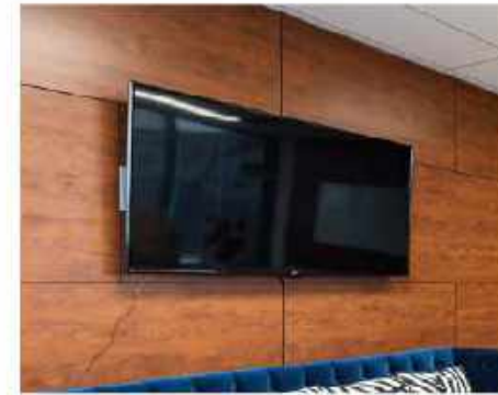
SURFACE WALL MONITOR