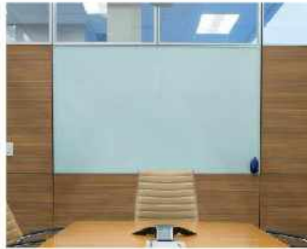
WHITE BOARD/ SLOT WALL