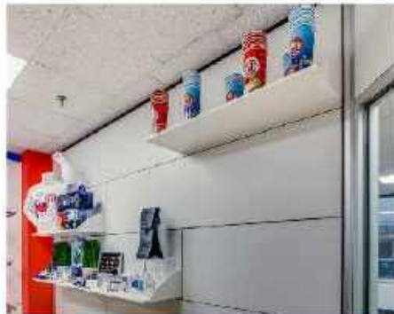
SHELVING & CANTILEVER BRACKETS