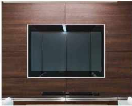
IN WALL MONITOR